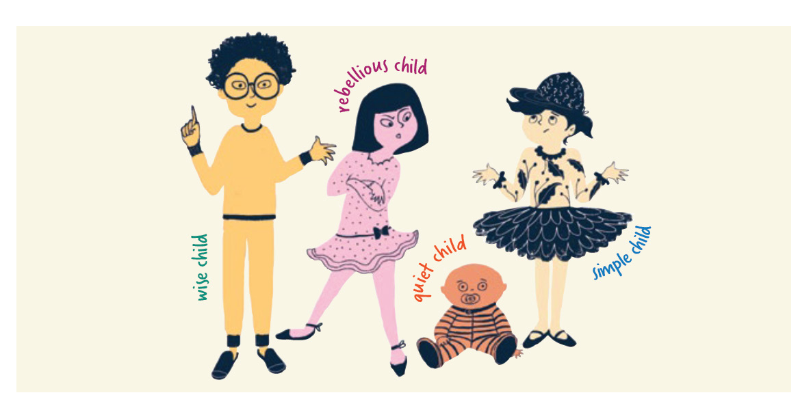
From the PJ Library Haggadah

* For "extra credit," you could learn about some of the individuals being memorialized by the Ot Hayim project (ot-hayim.co.il) with new Hebrew fonts created based on their handwriting, and type out questions or discussion points you are raising on their behalf in their specialized fonts.